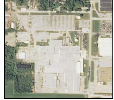
Fiberglass Fabricator, Site 1754-PZ