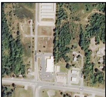
Pipe Supply Company, Site 1754-IQ

The REC sites identified in the study area include: