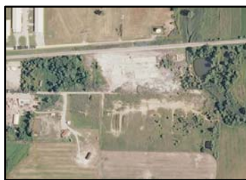
Sandoval Zinc Smelter, Site 1754-FM

The US 51 study area identified sites where there is a potential for soil or groundwater contamination. There are a variety of activities or conditions that could cause contamination. These sites are concentrated in Centralia and Vandalia, as these are the largest urbanized areas within the study area.